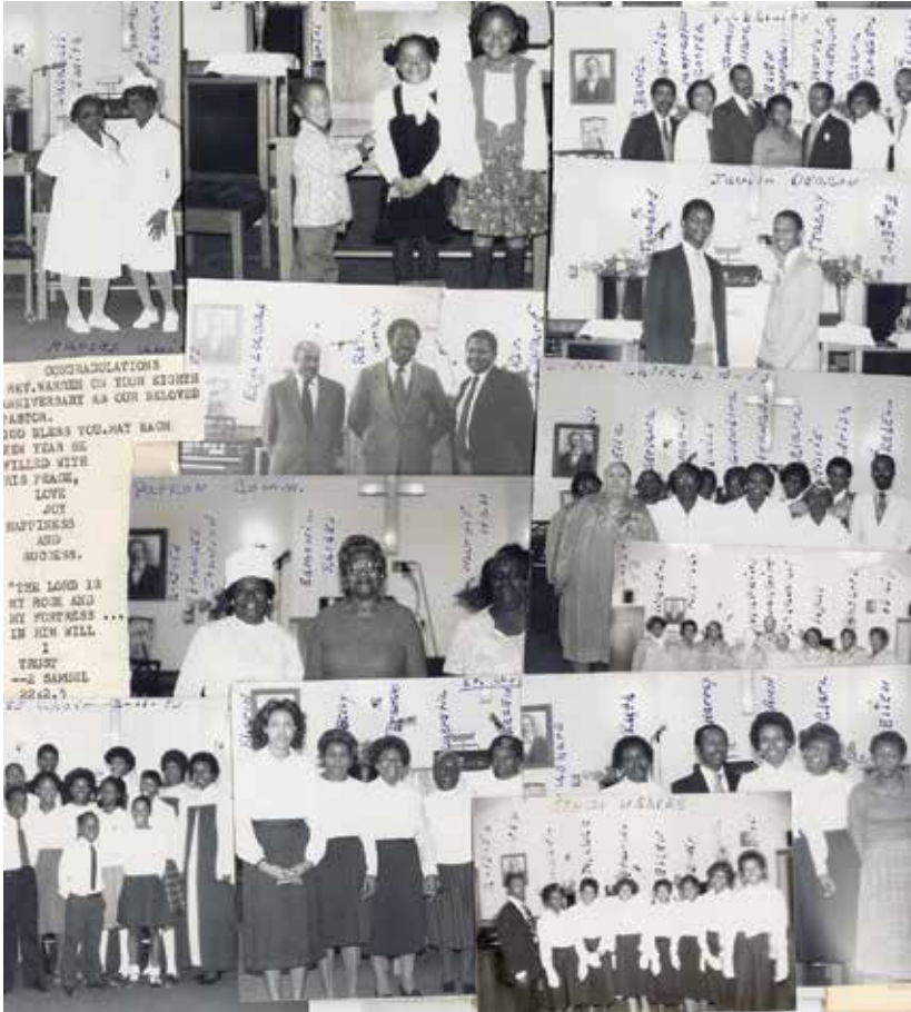
Macedonia Baptist Church collage (detail).