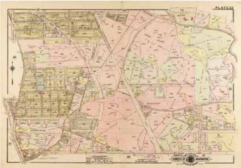
Baist's Real Estate Atlas, 1919. Survey of Reno Road Area.