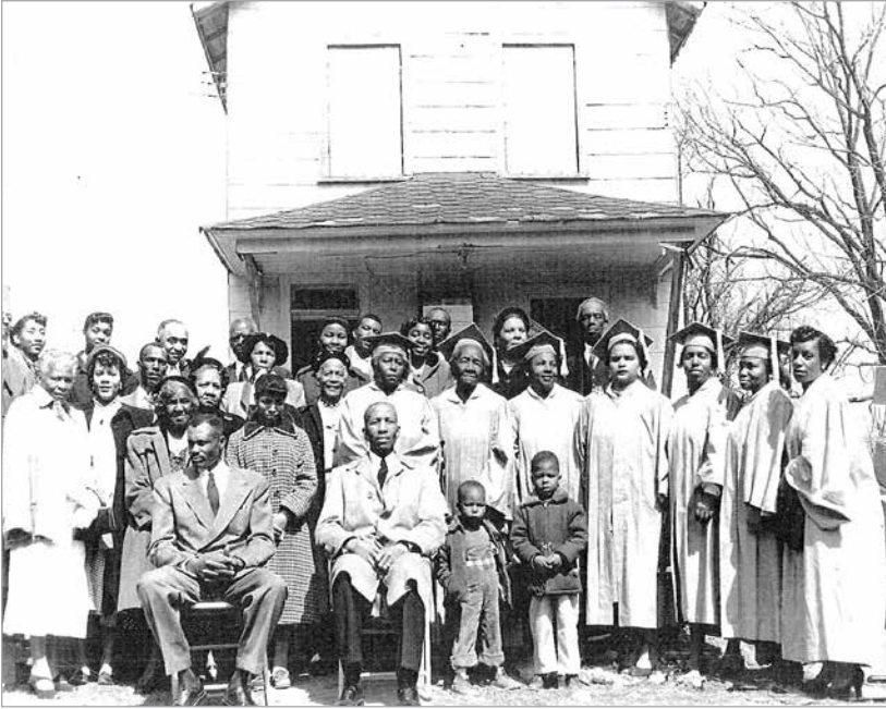
Macedonia Baptist Church in its first years at its current address.