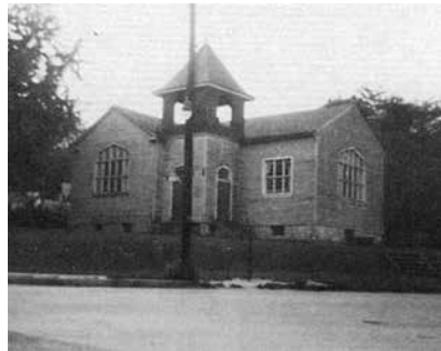
Rock Creek Baptist Church, circa 1900s.

This ultimately resulted in the razing of Reno City, approved by Congress in the 1920s, although the purchasing of homes and condemnations by the DC Board of Commissioners had already begun. By falsely claiming that the neighborhood was falling apart, local and federal departments took this opportunity to rid this “blight upon this part of