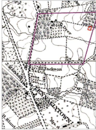
Boschke Map of Reno City, 1861.