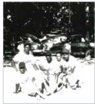
Above: River Road School, circa 1930s.