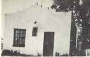
Tobeytown? When they had their own neat little church and church bus?

What happened to this happy community which once had a church, a community vegetable garden, plow horse, cow and a flock of chickens?