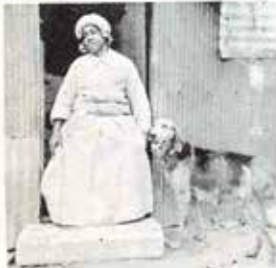
at her usual observation post, sitting in the rocker in her doorway.