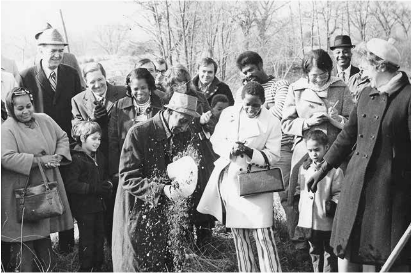
Scotland groundbreaking in 1972.