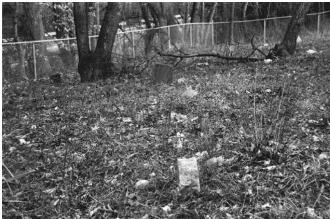
Tobytown Cemetery circa 1993.