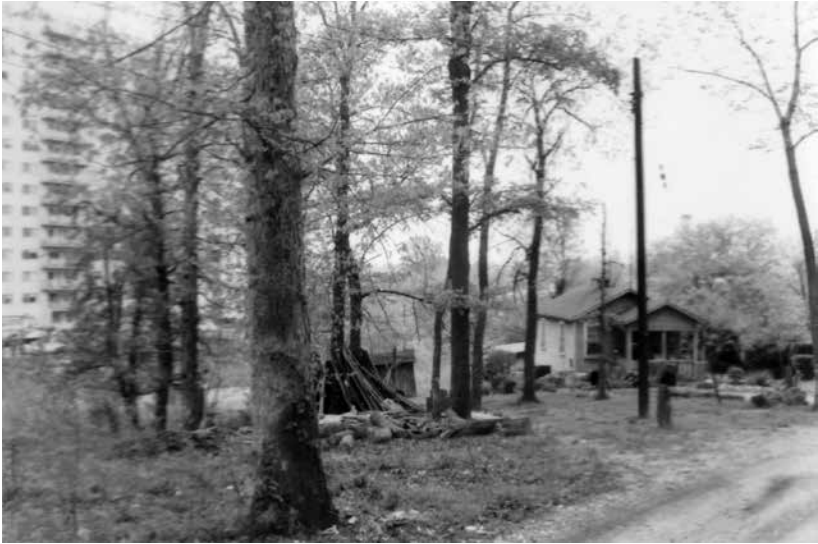
View from Dorsey Lane, Bethesda, MD. Juxtaposing the modest single story home and its wooded surrounding against the backdrop of an industrial building, this photo captures the shift away from rural living and towards urban development that claimed Montgomery County neighborhoods in the 60s and 70s.