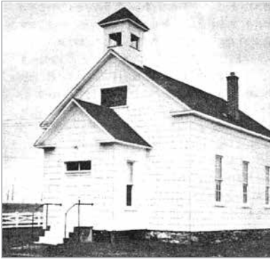
The Travilah Baptist Church on Travilah Road, established in 1884.