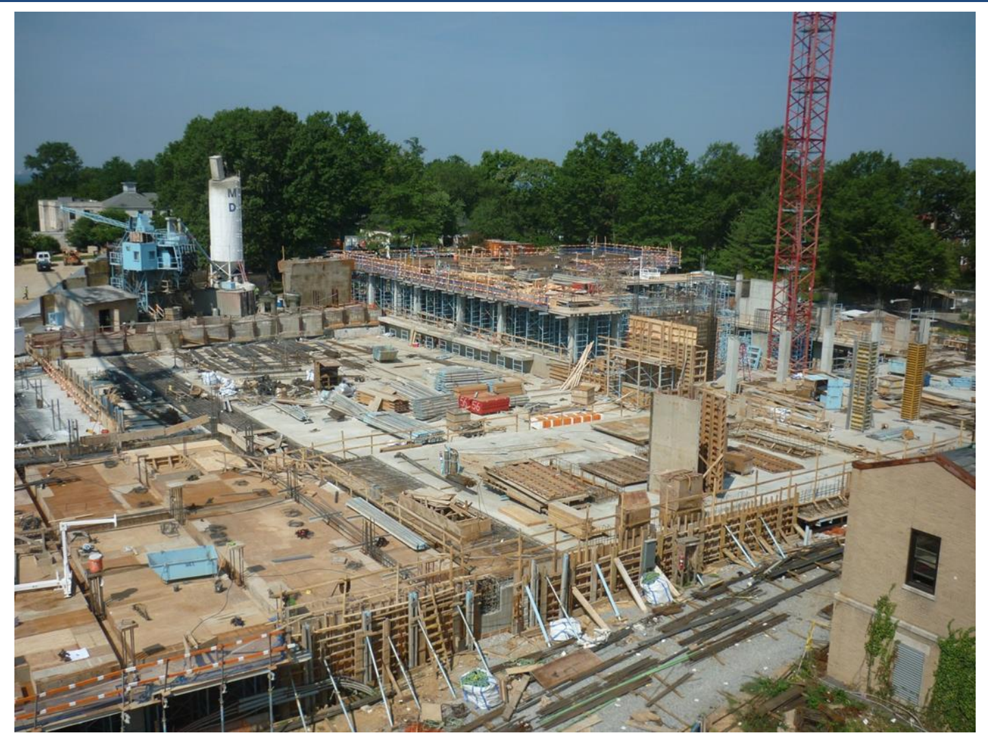
Terrace/roof deck and Yuma Wing