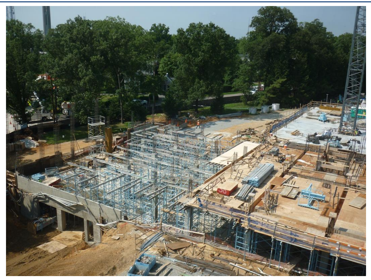
Garage entrance and Nebraska Wing