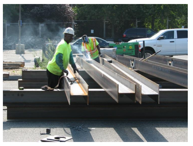
Shoring System - Soldier Pile Fabrication