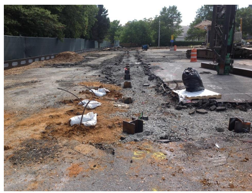
Soldier Pile installation