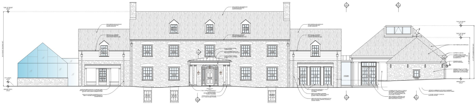
2 PROPOSED SOUTH ELEVATION SCALE: 3/16" = 1'-0" NEW CONSTRUCTION