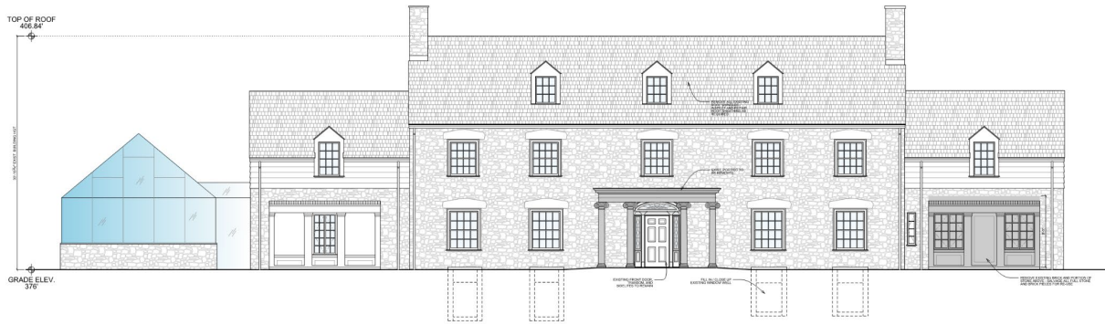
1 EXISTING SOUTH ELEVATION SCALE: 3/16" = 1'-0" DEMOLITION