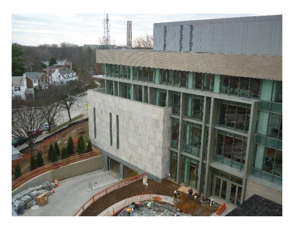
Garage entrance and Nebraska Wing