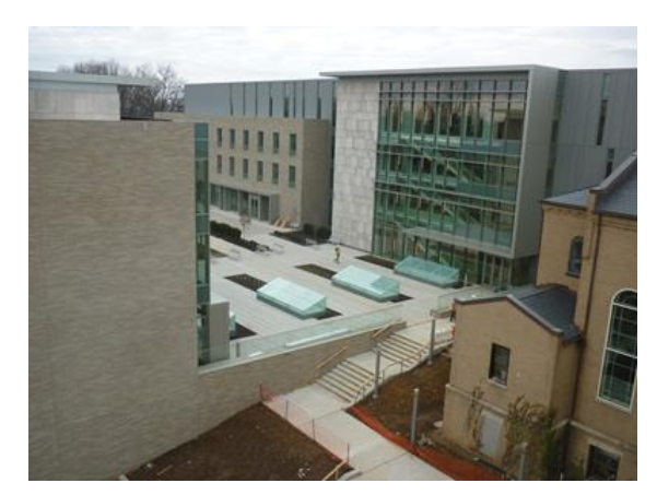
Terrace/roof deck and Yuma Wing