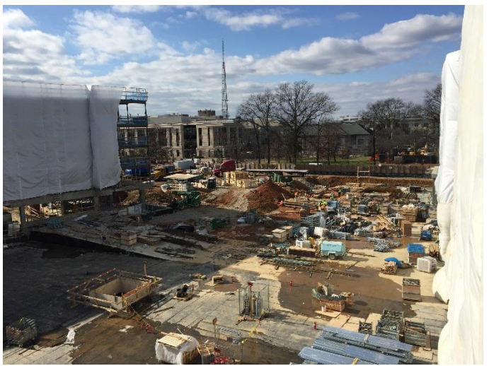
Buildings 1, 2, 3 and Courtyard