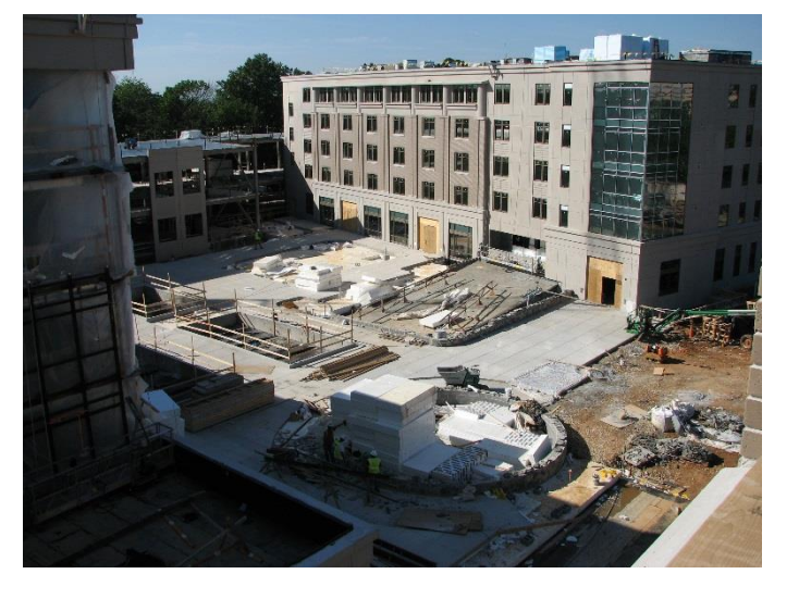
Buildings 1, 2, 3 and Courtyard