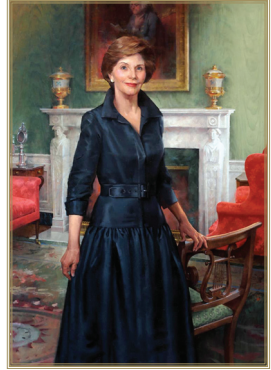
First Ladies portraits courtesy of The White House Historical Association (White House collection).

“THE CONSTITUTION OF THE UNITED STATES DOES NOT MENTION THE FIRST LADY. SHE IS ELECTED BY ONE MAN ONLY. THE STATUTE BOOKS ASSIGN HER NO DUTIES; AND YET, WHEN SHE GETS THE JOB, A PODIUM IS THERE IF SHE CARES TO USE IT. I DID.” - LADY BIRD JOHNSON