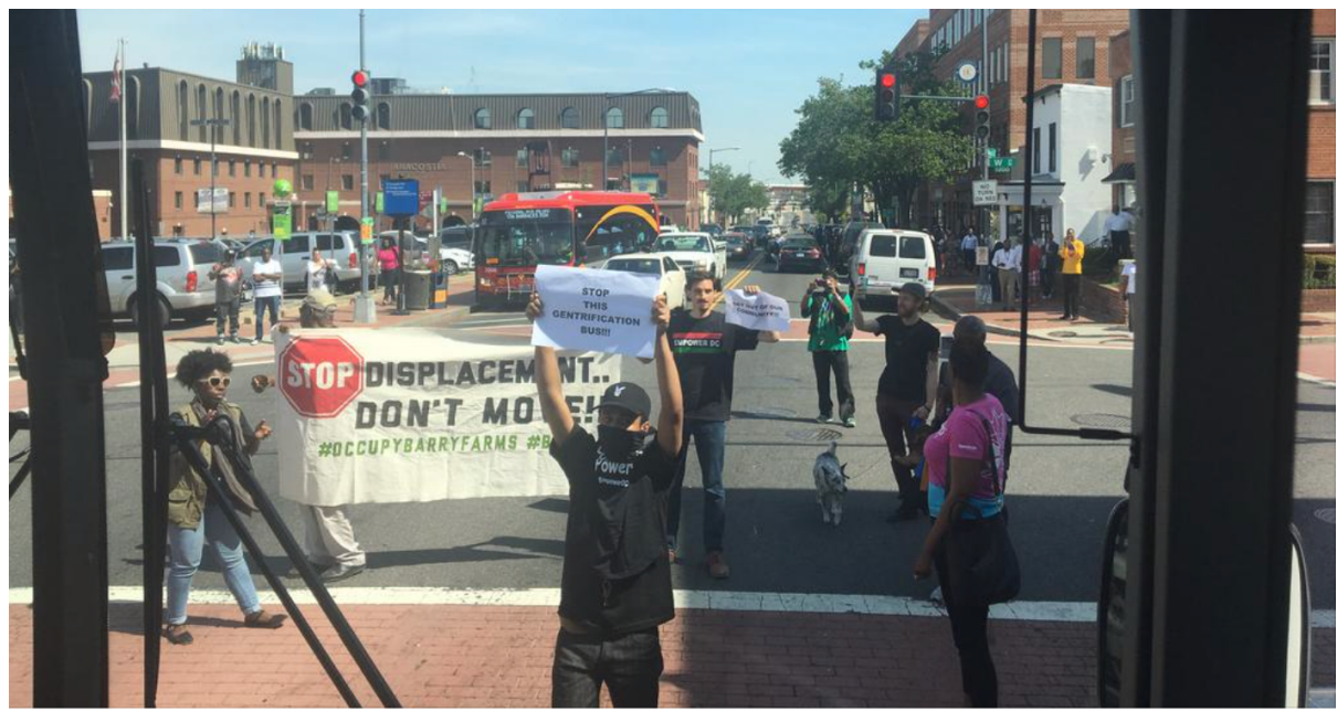
Protestors block the "space finding" gentrification bus tour in Anacostia.