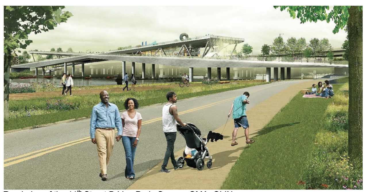
Rendering of the 11th Street Bridge Park.

Supported by a comprehensive 2018 Equitable Development Plan<sup>4</sup> (EDP) and headed by the nonprofit Building Bridges Across the River conceived by the DC developer WC Smith to support the revitalization of SouthEast DC, the Bridge Park has been touted as possibly the best model of green, inclusive, healthy, and housing rights-centered infrastructure planning in the US (Avni 2018). It did not arise directly from residents' demands, but is rather an externally conceived, nonprofit-driven project. However, the nonprofit leaders of the Bridge Park have explicitly framed the project as community-centered, unlike other projects like the now infamous New York High Line, the Chicago 606, or the Atlanta Beltline, which have had negative economic and racial impacts. For instance, Bridge Park explicitly put African American arts and culture are at the center of the vision for the new space.