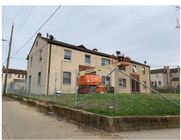
Historic Anacostia (left) vs. remaining buildings and demolition of Barry Farms public housing development (right). Photos by Isabelle Anguelovski taken in April 2019

By contrast, directly west of the Anacostia River, Navy Yard (together with near southeast) is a post-military and post-industrial neighbourhood cleaned up and redeveloped in 2020 to host new townhomes, bike lanes, shops, restaurants, wineries, a Whole Foods Market, restored waterfronts, bike and walking nature trails, and other so-called accessible and attractive green