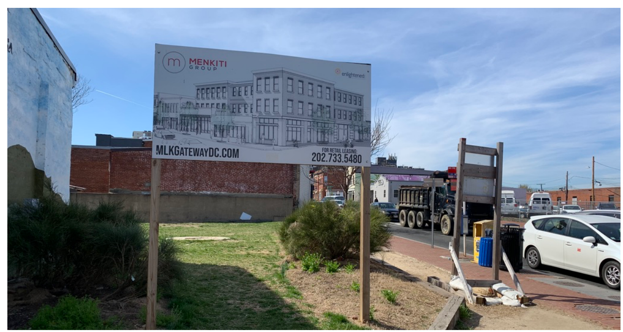
Sign for the new MLK Gateway project planned for 2020. taken in April 2019