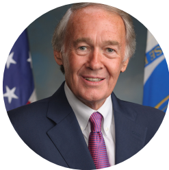
Senator Ed Markey (D-MA)